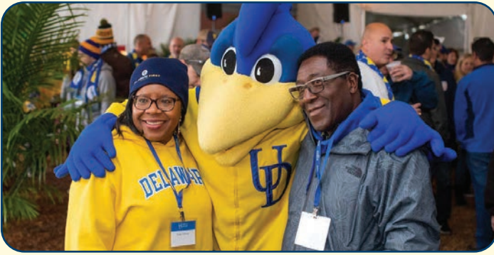
Blue Hens alumni, friends, parents and students gather to celebrate their blue and gold spirit at Homecoming.