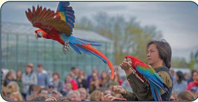
Always held on the last Saturday in April, AG Day has activities for the entire family to enjoy.