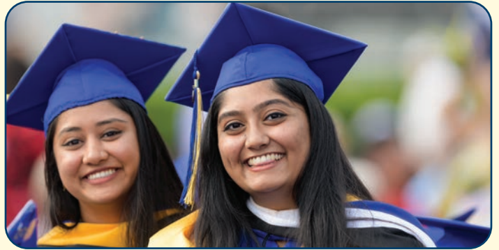
Volunteer during graduation ceremonies or simply attend one of the most memorable events of the semester.