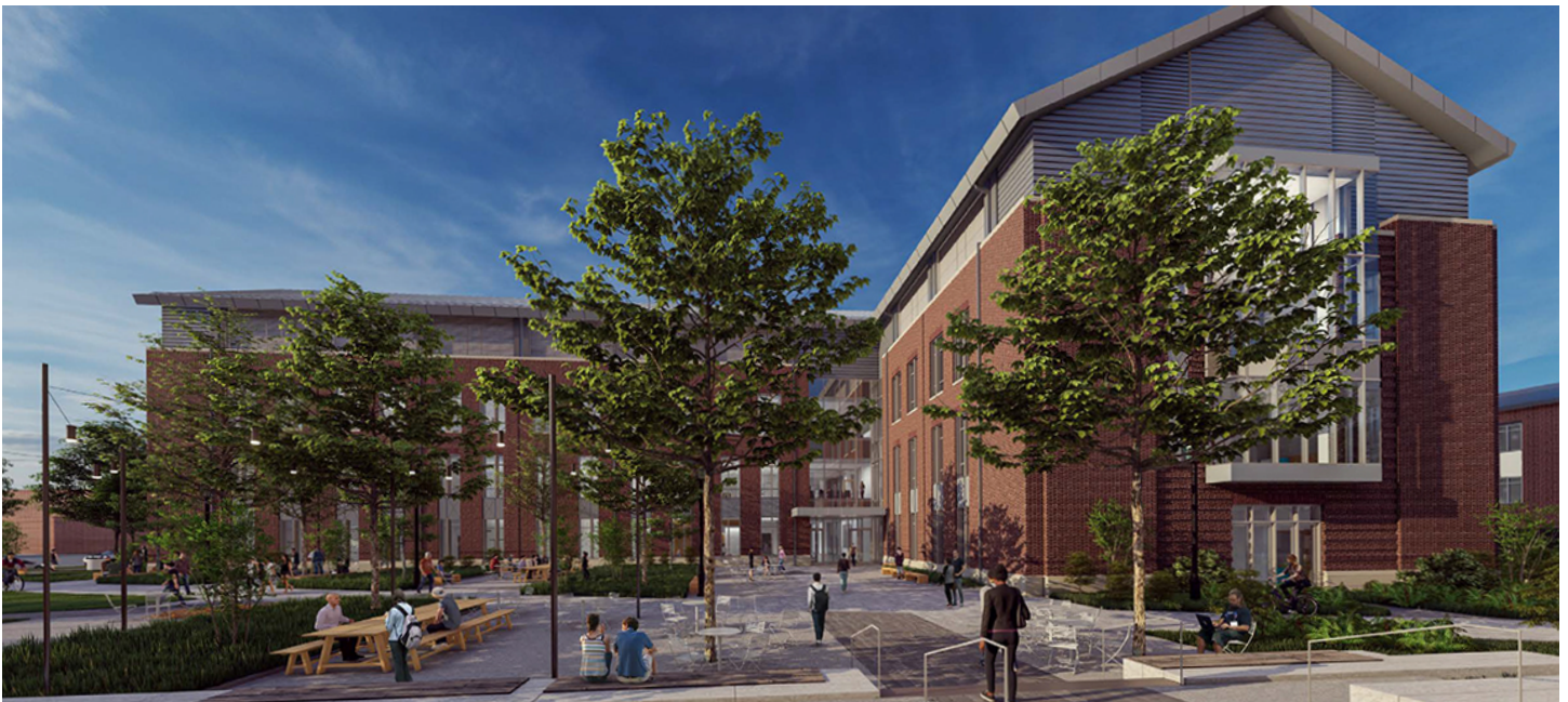
Rendering: Building X west campus facade