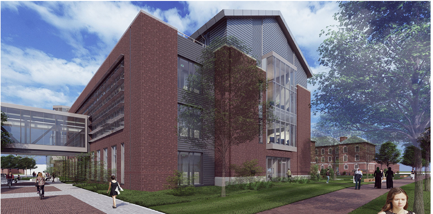
Rendering: Building X exterior

The offices will be in close proximity to teaching and research labs, ensuring faculty can meet with students, teach and conduct their own experiments in the same building, which creates efficiencies and opportunities for interaction.