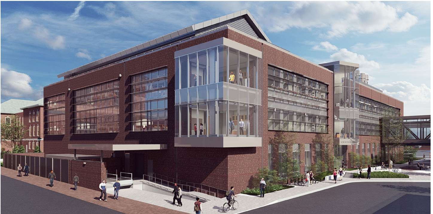
Rendering: Building X southeast view

The offices will be in close proximity to teaching and research labs, ensuring faculty can meet with students, teach and conduct their own experiments in the same building, which creates efficiencies and opportunities for interaction.