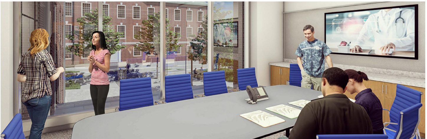
Rendering: Building X conference room

The common spaces will have high-tech equipment for productive, collaborative meetings among students, faculty, visiting scholars and lecturers and more.