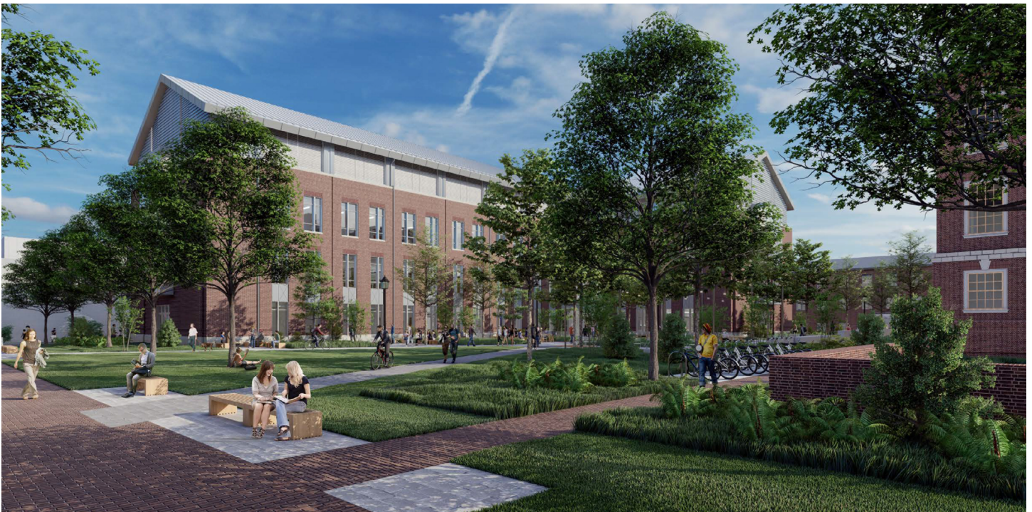
Rendering: Building X northwest view

This space will support the maintenance and care of instruments and equipment in the Physics labs.