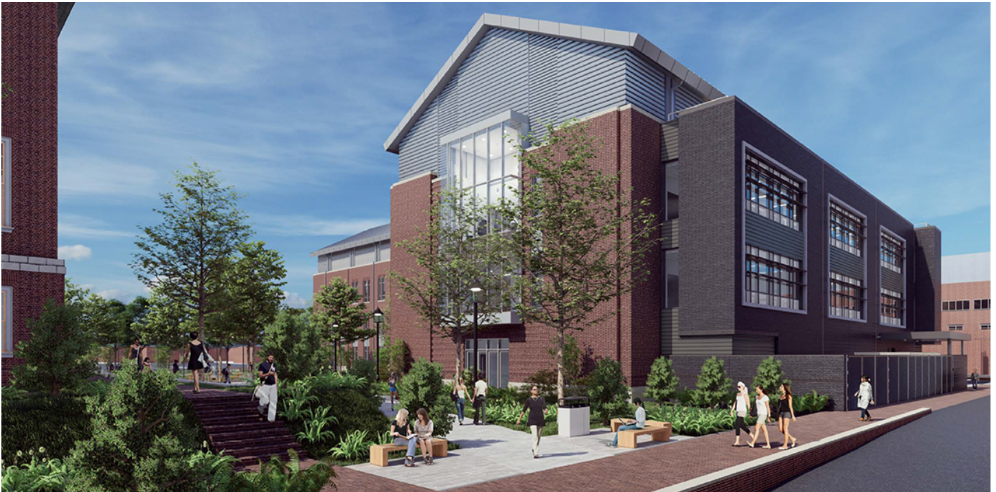
Rendering: Building X southwest view

The offices will be in close proximity to teaching and research labs, ensuring faculty can meet with students, teach and conduct their own experiments in the same building, which creates efficiencies and opportunities for interaction.