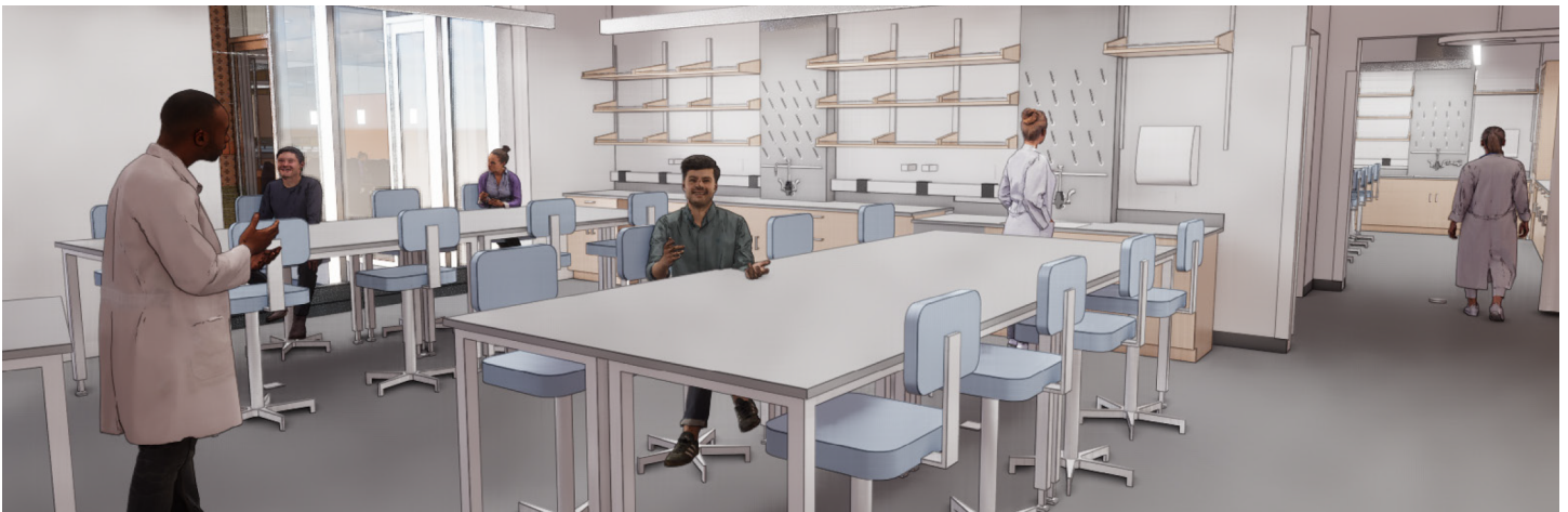
Rendering: Building X teaching lab

This space will include specialized resources for students to have hands-on learning opportunities during both class labs and open lab time.