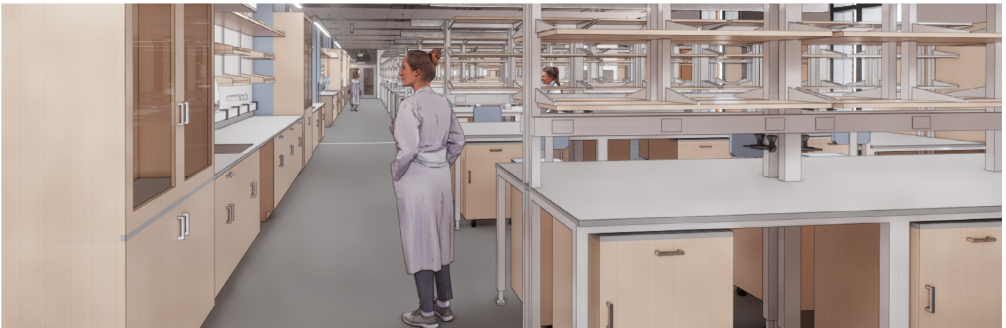
Rendering: Building X research lab

The common spaces will have high-tech equipment for productive, collaborative meetings among students, faculty, visiting scholars and lecturers and more.