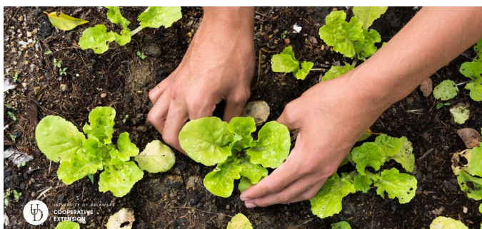
A gardener planting lettuce in soil.