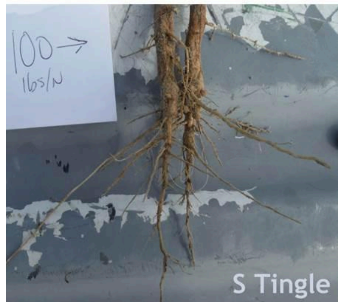
Figure 2. Comparison of soybean nodule development on unfertilized plants (upper) and plants fertilized with urea at an N rate of 100 lb/ac.

While application of supplemental N might not reduce yield in all situations, it will often result in wasted money. In addition, some forms of N are easily lost to the environment in runoff or leachate. Application of supplemental N to soybean may increase the risk for N losses, which may have negative impacts on water quality. Application of supplemental N should be avoided under the following situations because the economic and environmental risks are increased: