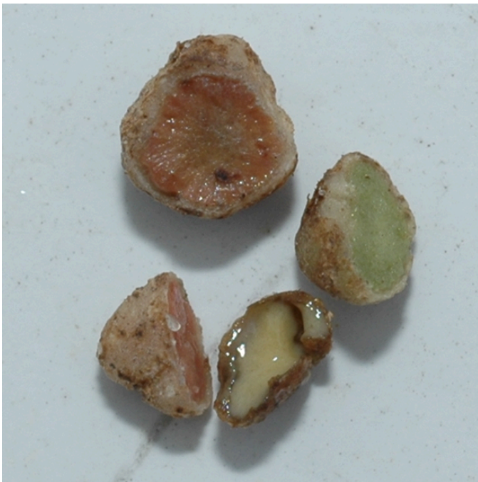
Figure 3. Soybean nodules with a pink color are actively fixing atmospheric N. Soybean nodules with a green or milky-white color are inactive.