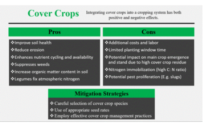
Figure 4: Pros and cons of using cover crops with mitigation strategies.

Integrating cover crops into the system will result in benefits and possible tradeoffs (Figure 4). As such, growers should consider how to best limit potential negative impacts when selecting cover crops, seeding rates, and management practices. In addition, growers should consider the availability and compatibility of planned cover crops with available equipment and the potential expenses associated with planting, managing, and terminating the cover crop.