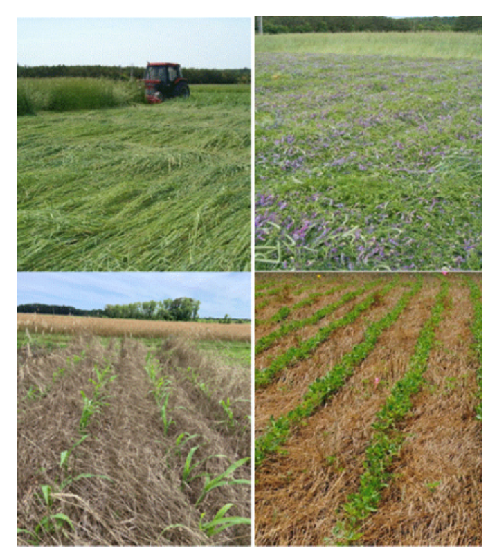
Figure 1: Fall cover crops and cover crop residues in corn and soybean fields in the Mid-Atlantic region of the U.S. (Source: University of Delaware Carvel REC).