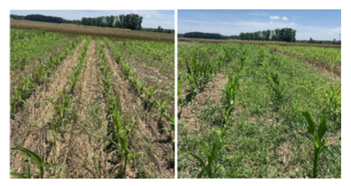
Figure 3: Weed populations were lower in the corn field planted into a cereal rye cover crop (left) when compared to the corn field without a cover crop (right) at the Virginia Tech Eastern Shore Agricultural Research and Extension Center in Painter, VA (June 8, 2022).

the previous crop and return it to the soil surface for use by the next crop.