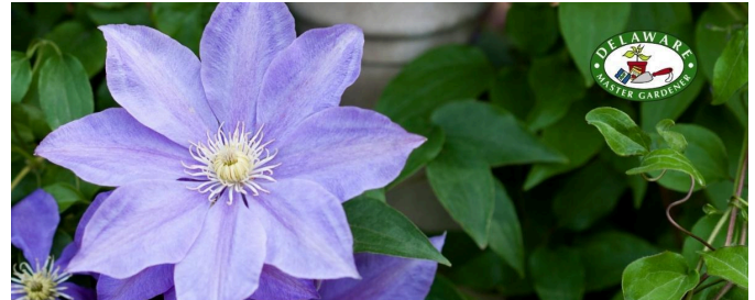
Purple Variety Clematis Image