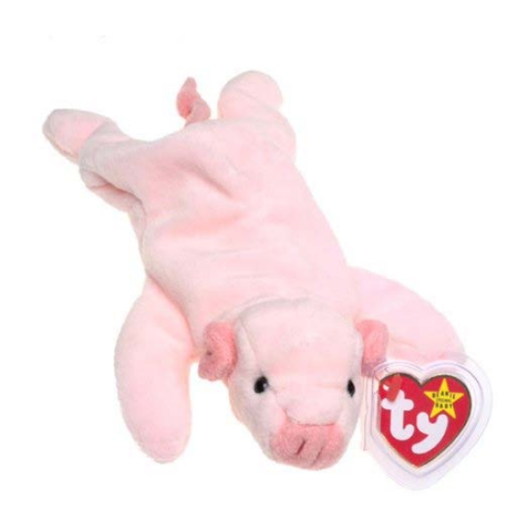
Ty, Inc.'s "Squeeler"