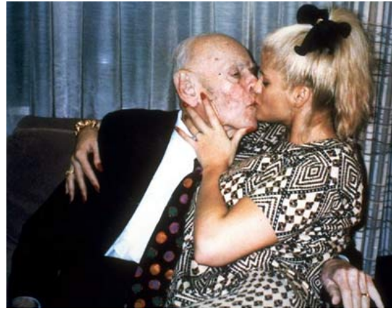
J. Howard Marshall and his bride, Anna Nicole Smith