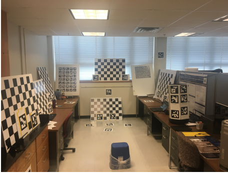
Fig. 2: Proof-of-concept indoor experiment setup for the proposed aided INS with point and plane features. ArUco makers [31] are placed in the workspace to serve as planar point features and thus to create point-on-plane constraints.